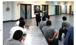
Barry J. Nidorf Juvenile Hall

“As a program service coordinator, I can attest to the difficulties of securing positive and influential role models to volunteer their time and talents to a facility such as ours. The need for motivating and inspiring youths to expand their horizons and become more productive members of their communities can be a difficult task. With programs such as yours...that task was made a little bit easier. A majority of our minors are known for their lack of attention and at times disrespectfulness, but during your performances those negative adjectives were absent. Fidgety and disrespectful minors were mesmerized by the sounds of your instrument and helped pacify the negative needs for attention. I can still hear the echoes of “love was hard for Billy and Brenda” ricocheting off the walls.”