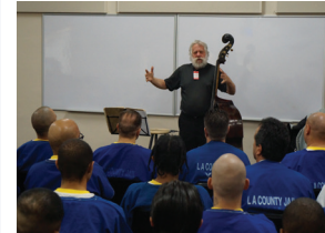
Pitchness Detention Center, LA County Jail